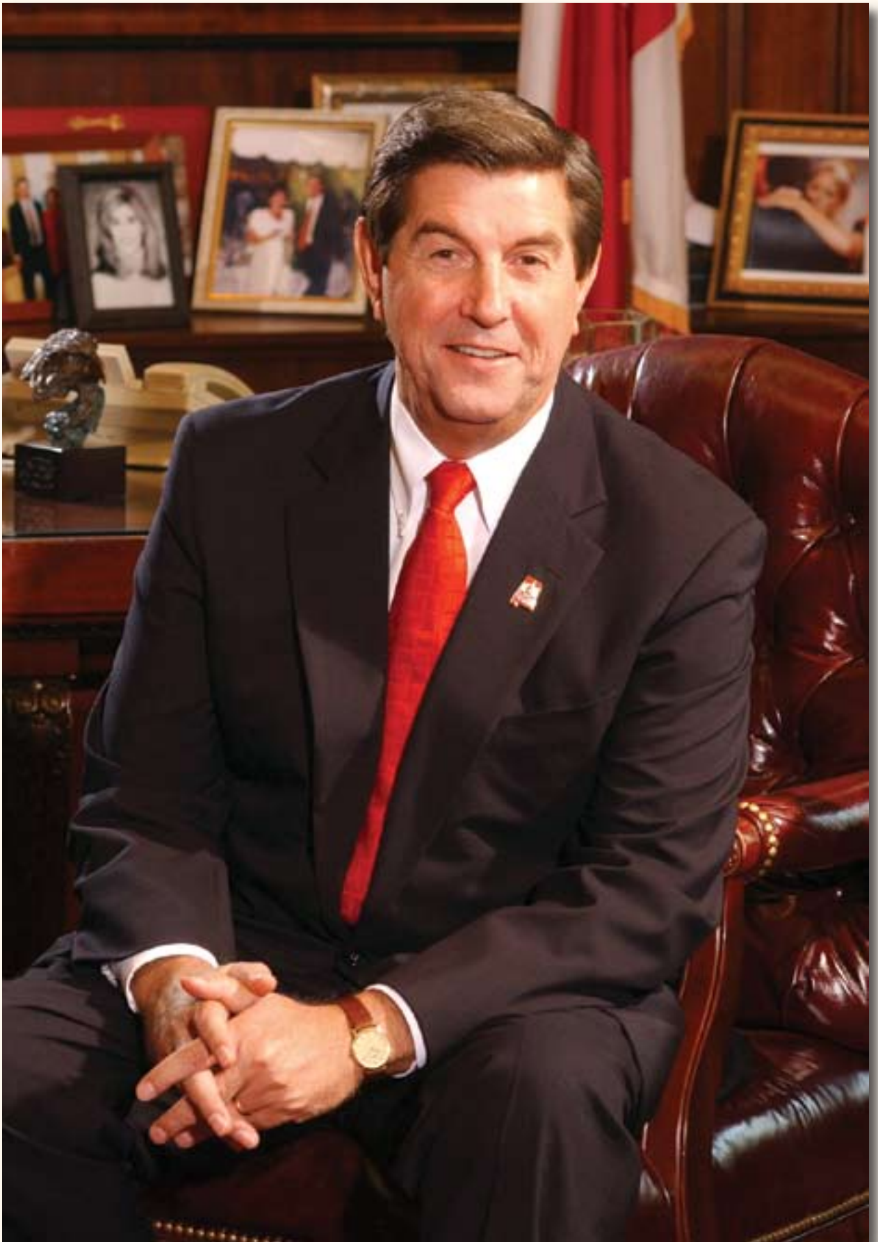
GOVERNOR BOB RILEY